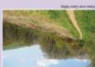
Stream in the Garw Valley

Telephone 01656 642553 or 01656 642593 or by e-mail at rightsofway@bridgend.gov.uk